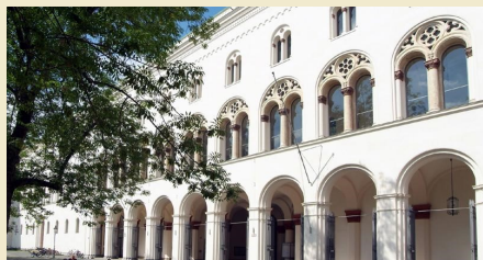
Main building of the University