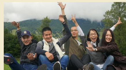
Excursion of the CSC Scholars

In 2005 Ludwig-Maximilians-Universität München (LMU Munich) was the first German university to sign an agreement with the China Scholarship Council (CSC). The main goal of this agreement is to enable especially qualified Chinese postgraduates to receive their doctoral degree or to spend a doctoral research period at LMU. The LMU-CSC-Program has since become so well established that it now prevails as a keystone of strategic cooperation between LMU and Chinese Institutes of Higher Education.